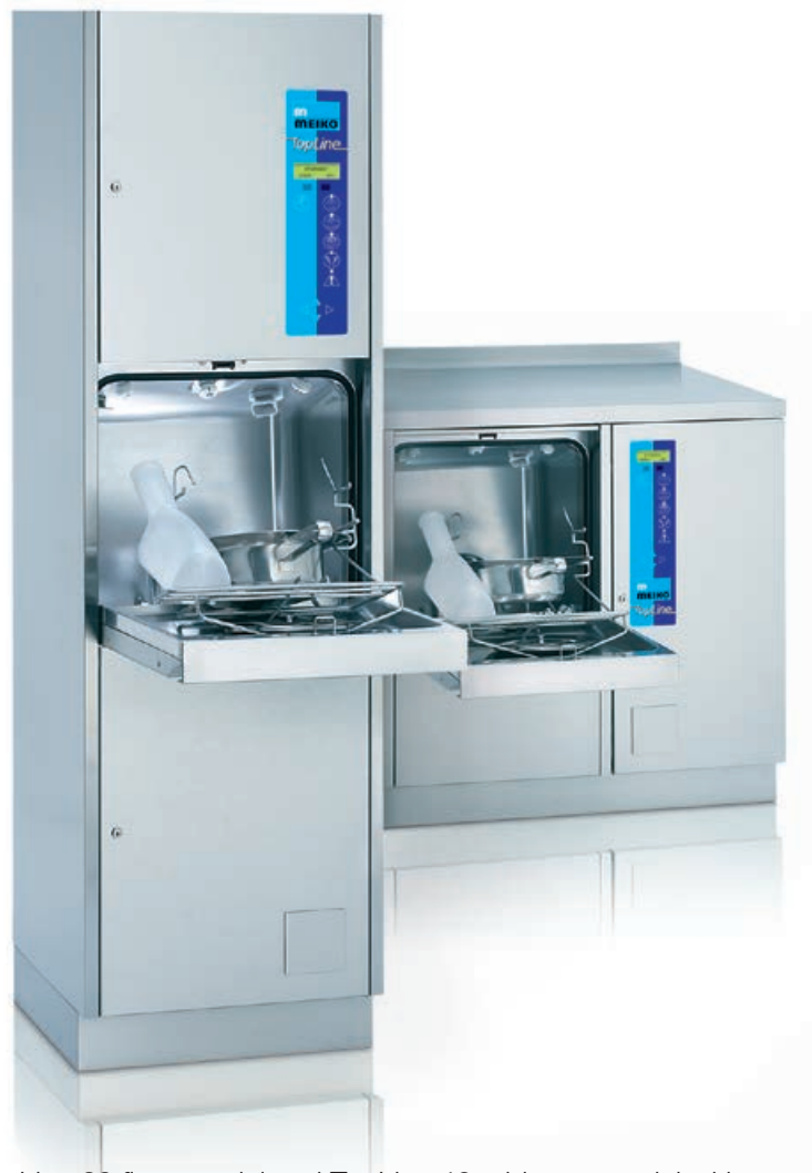
TopLine 20 floor model and TopLine 40 table top model with automatic door-opening (optional) and foot switch (optional).