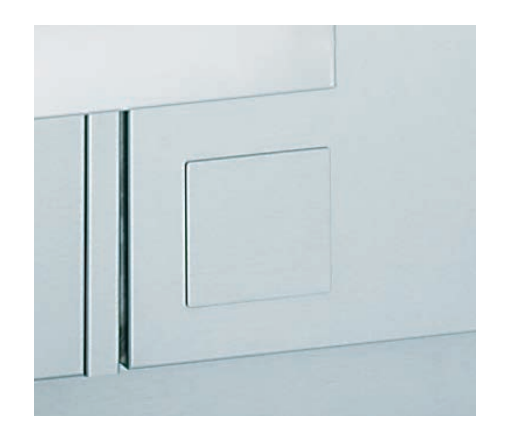
Opening and closing by using the foot switch (optional).